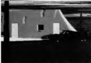
Chaykin sped toward the lab in his black Ferrari.

Lester Knight Chaykin jumped into his black Ferrari and sped toward the laboratory. All he wanted was to get to his experiment as quickly as possible. If the changes he had been mulling over all day worked . . . it was almost too much to consider. Ominous clouds and the crackling of a not-so-distant electrical storm filled his ears as he drove. So intent was he on his aims that he hardly noticed. He should have.